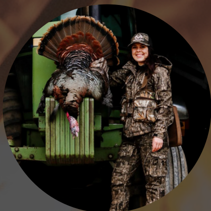
DEVON MULLENBACH 25K FOLLOWERS