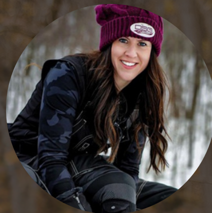
RICCA MOUNTIN 21K FOLLOWERS